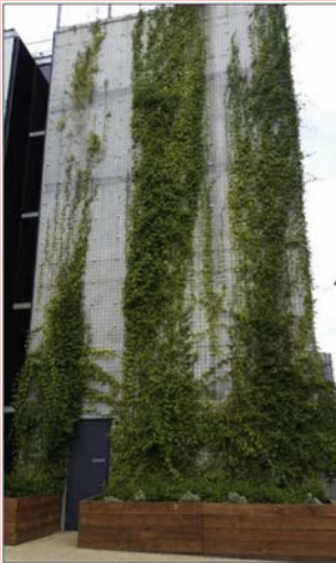
Fig 1: living wall

Integrated Grey Water Treatment (GWT) using green building vegetated structures provides buildings water recycling and urban cooling to conserve water and reduce energy requirements. Vegetation in living walls and green roofs are passive methods for energy savings in buildings. Integration with the GWT system fulfills the vegetation's water requirements that water scarce arid regions generally lack, while offering simultaneous water treatment.